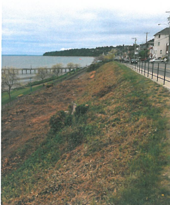
Photograph 1. Cleared slope looking west