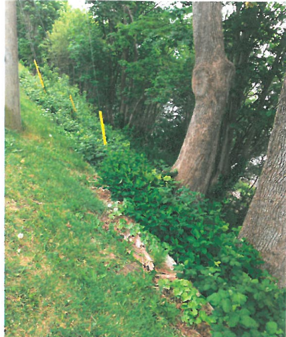
Photograph 2. Tree in front of wood retaining wall

We trust the information provided meets your immediate needs. Should you require further assistance, please contact us.