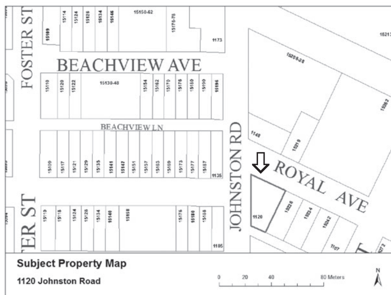
Site Map Bylaw No. 1955