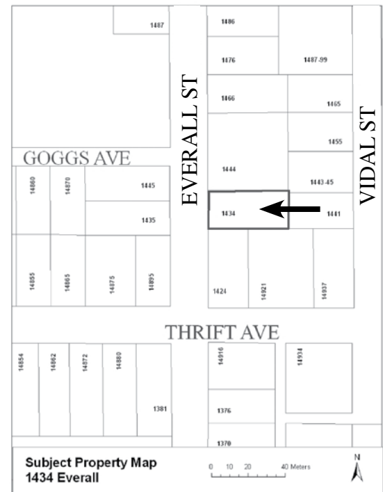
SITE MAP #2 (Bylaw No. 1941)

Should you have any comments or concerns you wish to convey to Council and you cannot attend the public hearings, please submit in writing to the City Clerk by 4:30 p.m., Monday, May 9, 2011. You may forward your submissions by: